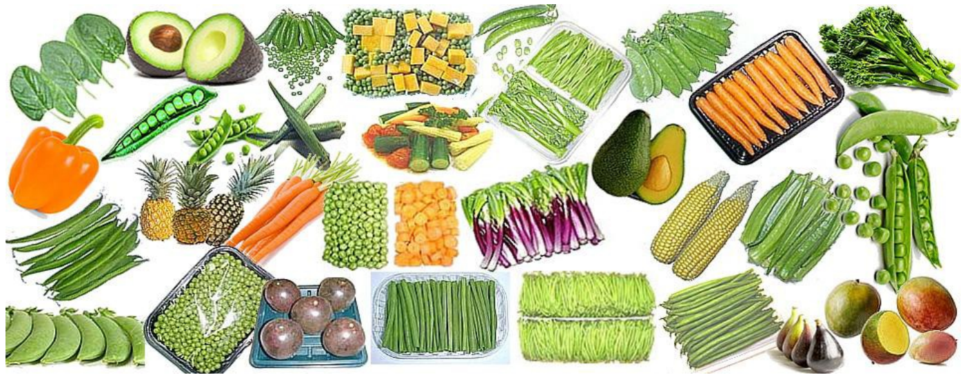
Varieties of vegetables and fruits

MAIN OFFICE: ST.GEORGES HOUSE PARLIAMENT RD3RD FLOOR P.O BOX 13738 CODE 00100 TEL: +254721336756/+254719696110 Email: siscosuperiorcargohandling@mail.com /info@siscosuperiorcargohandling.co.ke Website: www.siscosuperiorcargohandling.co.ke